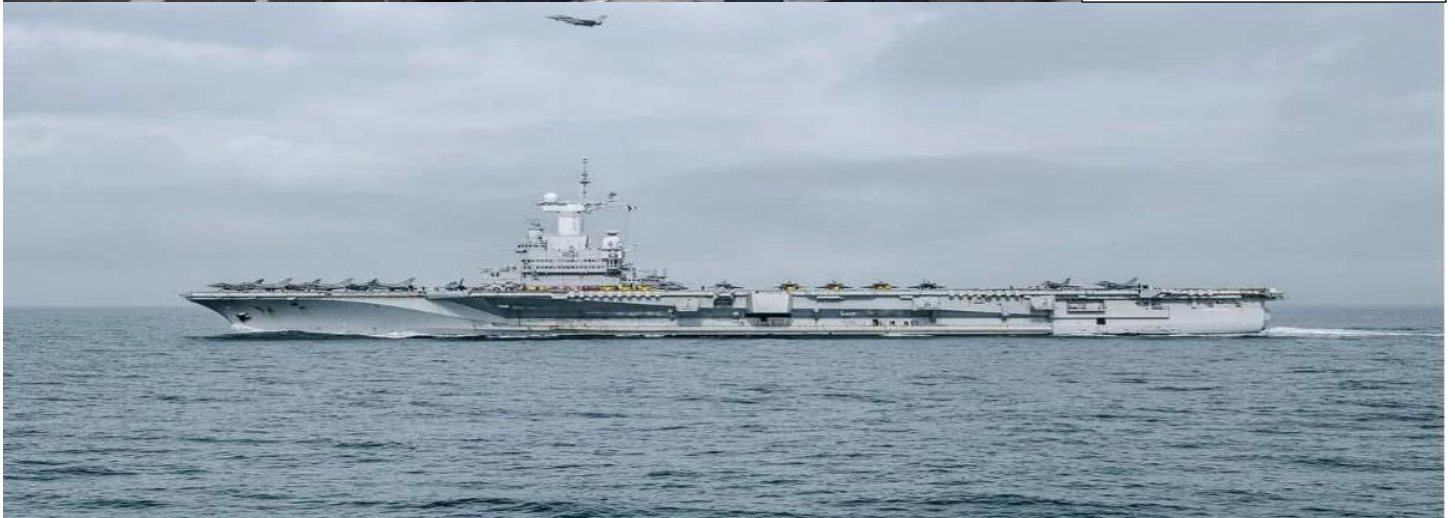
French aircraft carrier FS Charles De Gaulle (R91) en route to the Mediterranean, March 5, 2026.