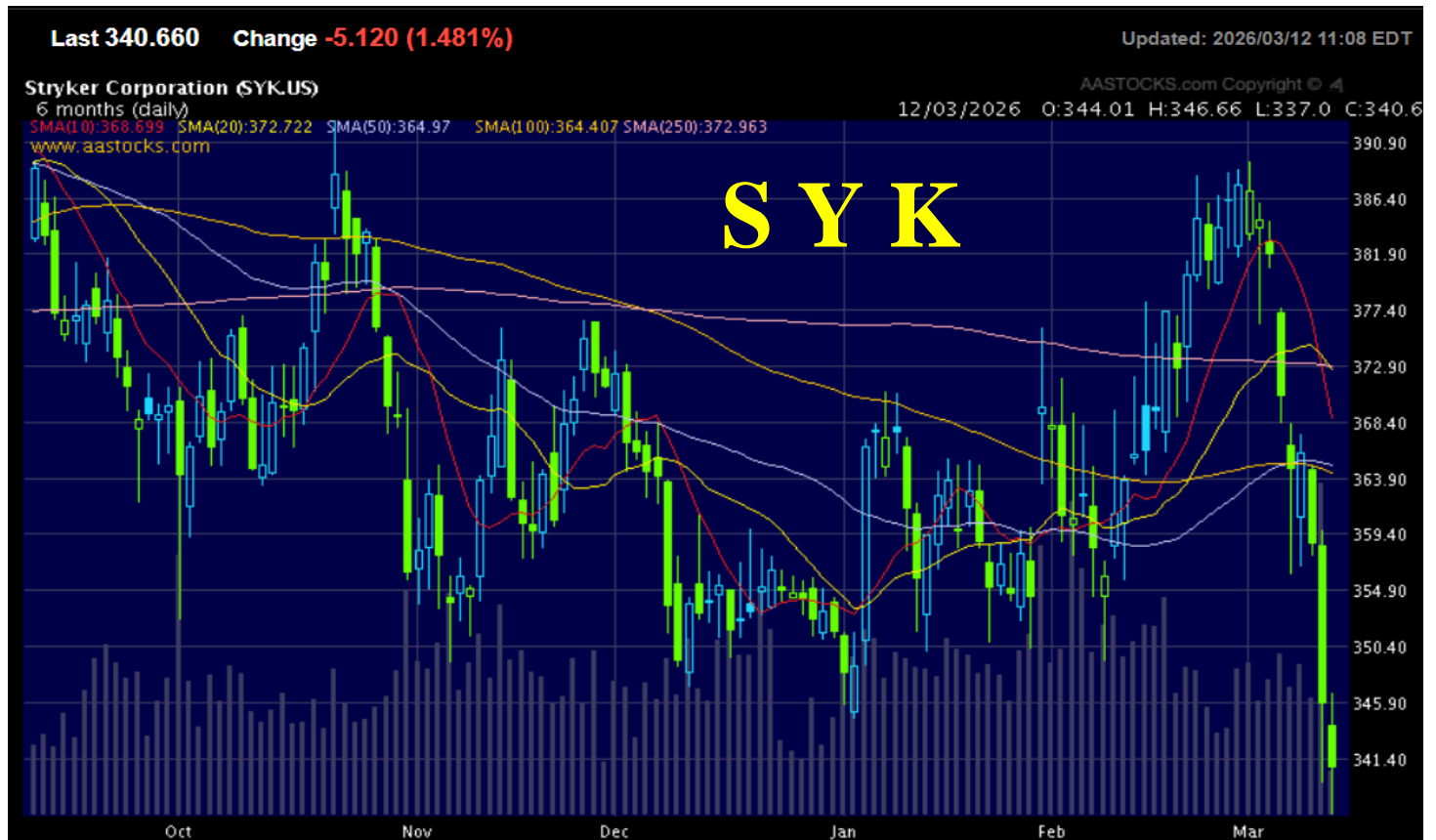
SYK under cyber-attack