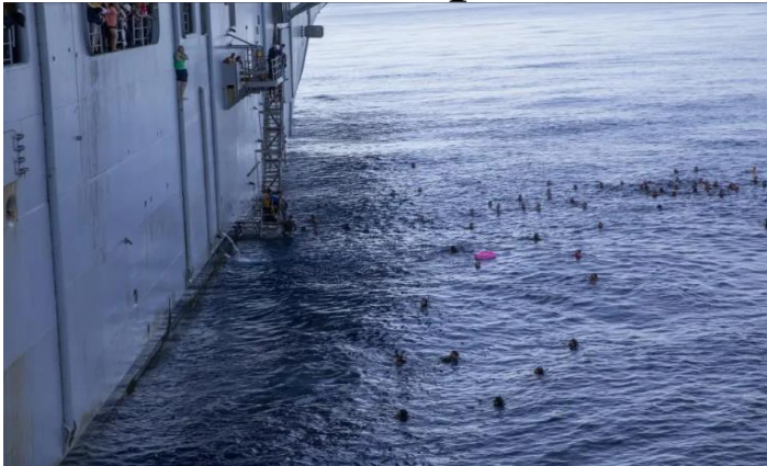
Swimming call of Marine Corps