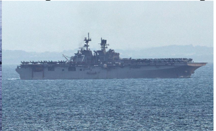
USS Tripoli passing Singapore to Malacca Strait