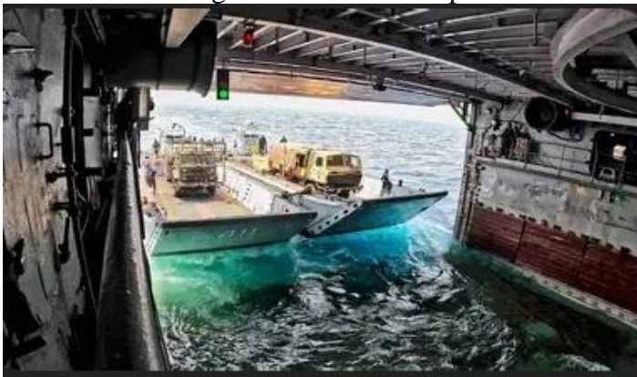
Lower deck of Tripoli not for planes but for ships and trucks to land