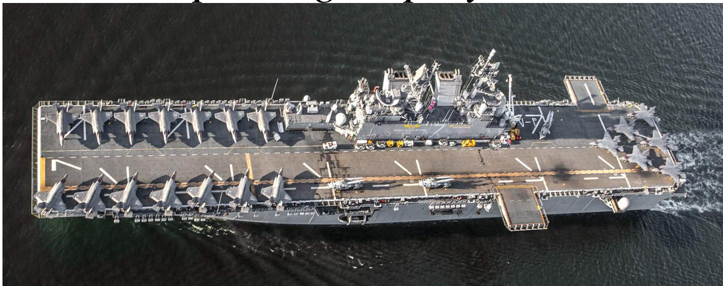
USS Tripoli (LHA7), the amphibious assault ship is now in Middle East but will stay for 14 days only.