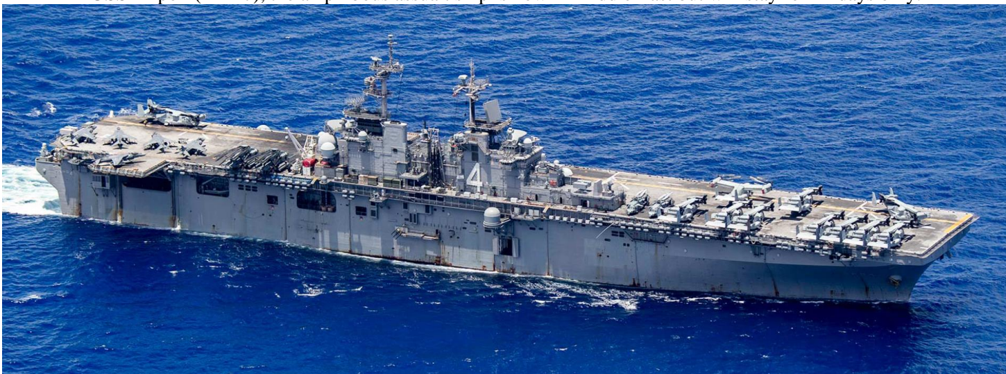
USS Boxer (LHD4) is now departing from Hawaii and will arrive Middle East in 14 days to replace USS Tropoli.