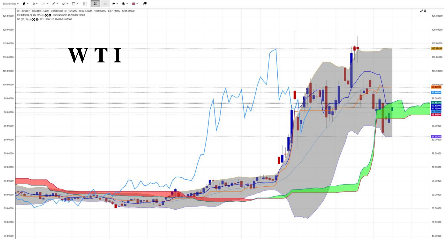
Oil prices got support in Bollinger Bands after and rebounded up into Ichimoku Cloud.