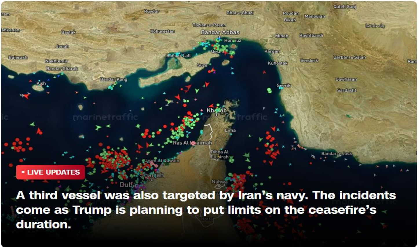
Live updates: Iran war news, Iran says it has seized two ships crossing Strait of Hormuz | CNN