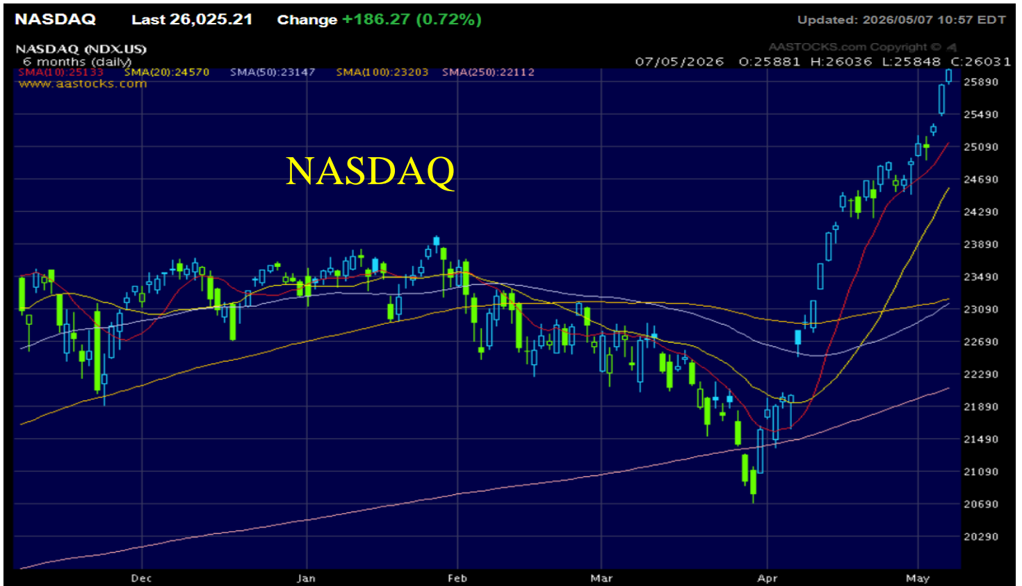
NASDAQ is still the leader of 4 major indexes, the 10-SMA is a nice support.