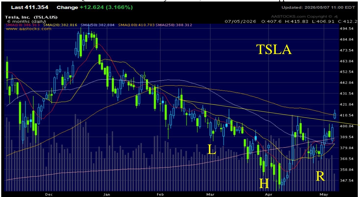
TSLA finished Reverse Head & Shoulders and jumped above the neckline, woke up from hibernation on Start of Summer