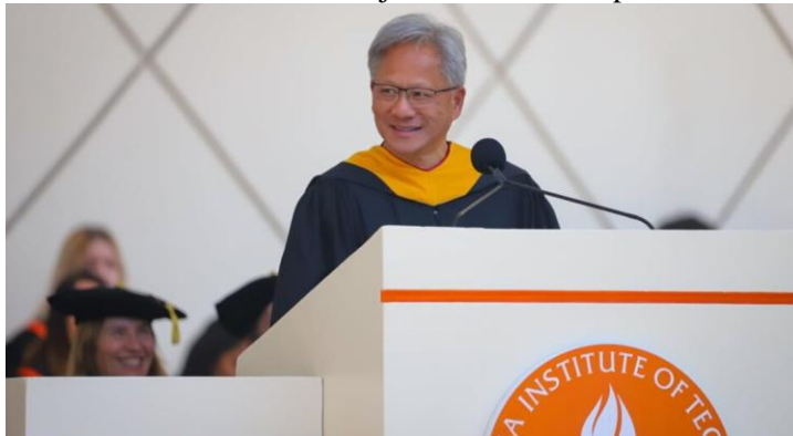
Jensen Huang in graduation ceremony of California Institute of Technology

NVDA had an adjustment in late April, therefore the current rise has more potential than NASDAQ