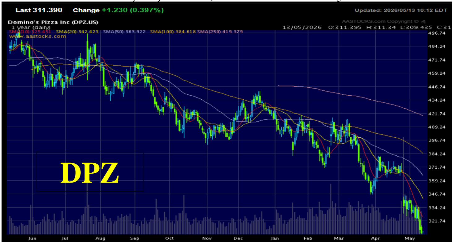
DPZ is the last stock that Warren Buffet purchased before retirement, and is said can made you become millionaire, best for those need copy trade.