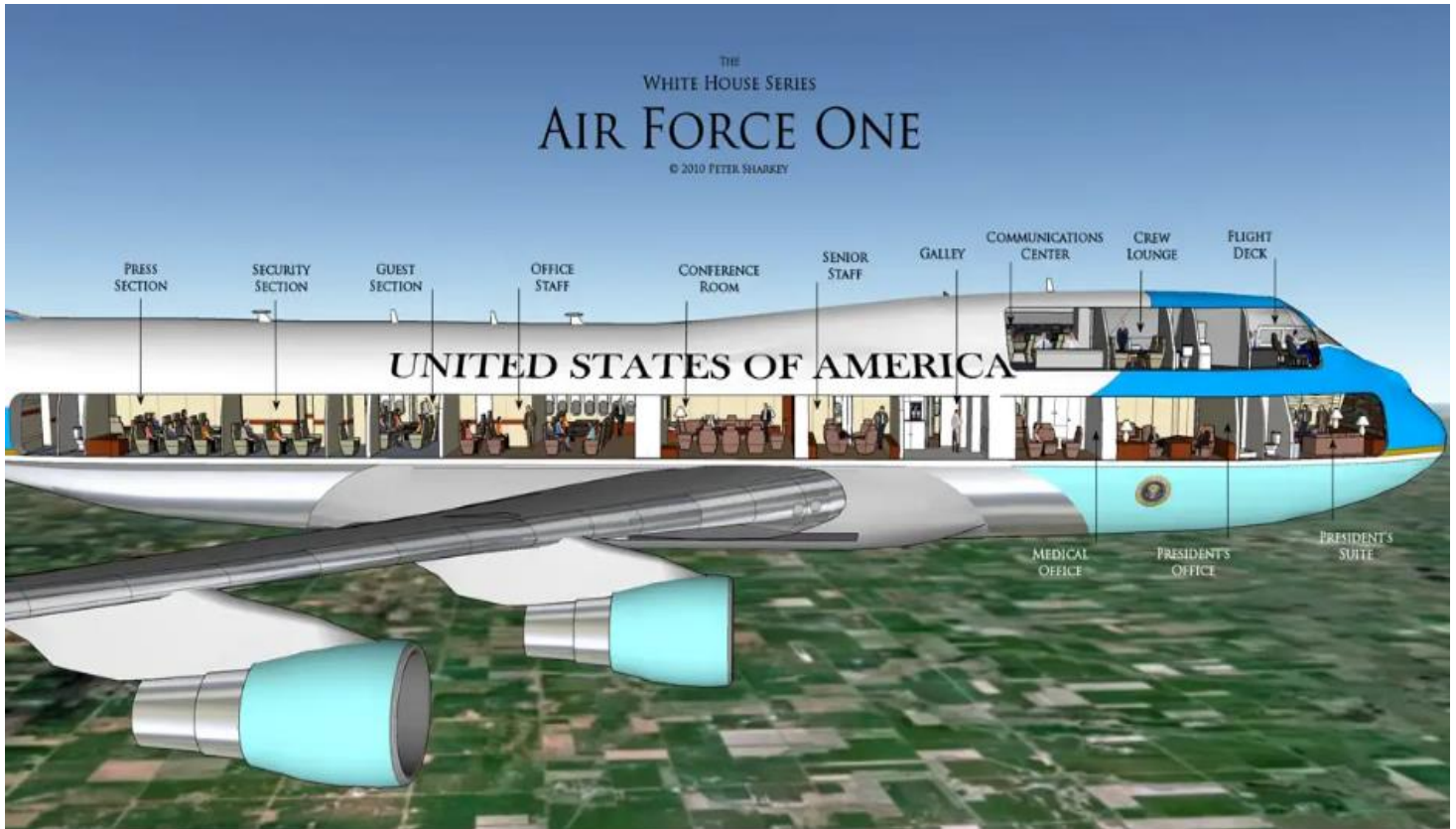
Air Force One has insufficient first-class seats for 18 CEOs