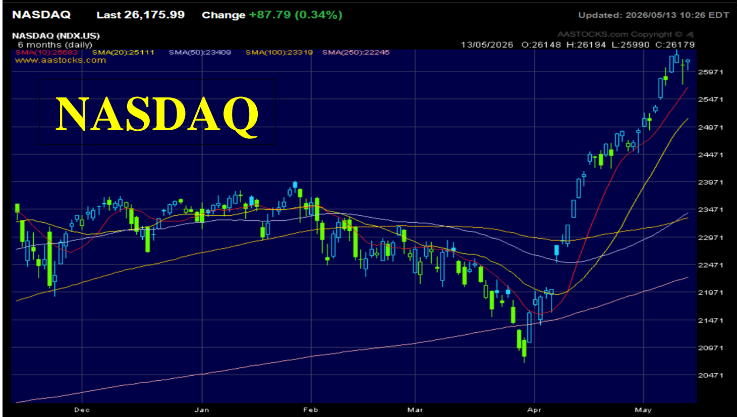
NASDAQ is benefitted by rise of AI stocks or NVDA, TSLA and AAPL.