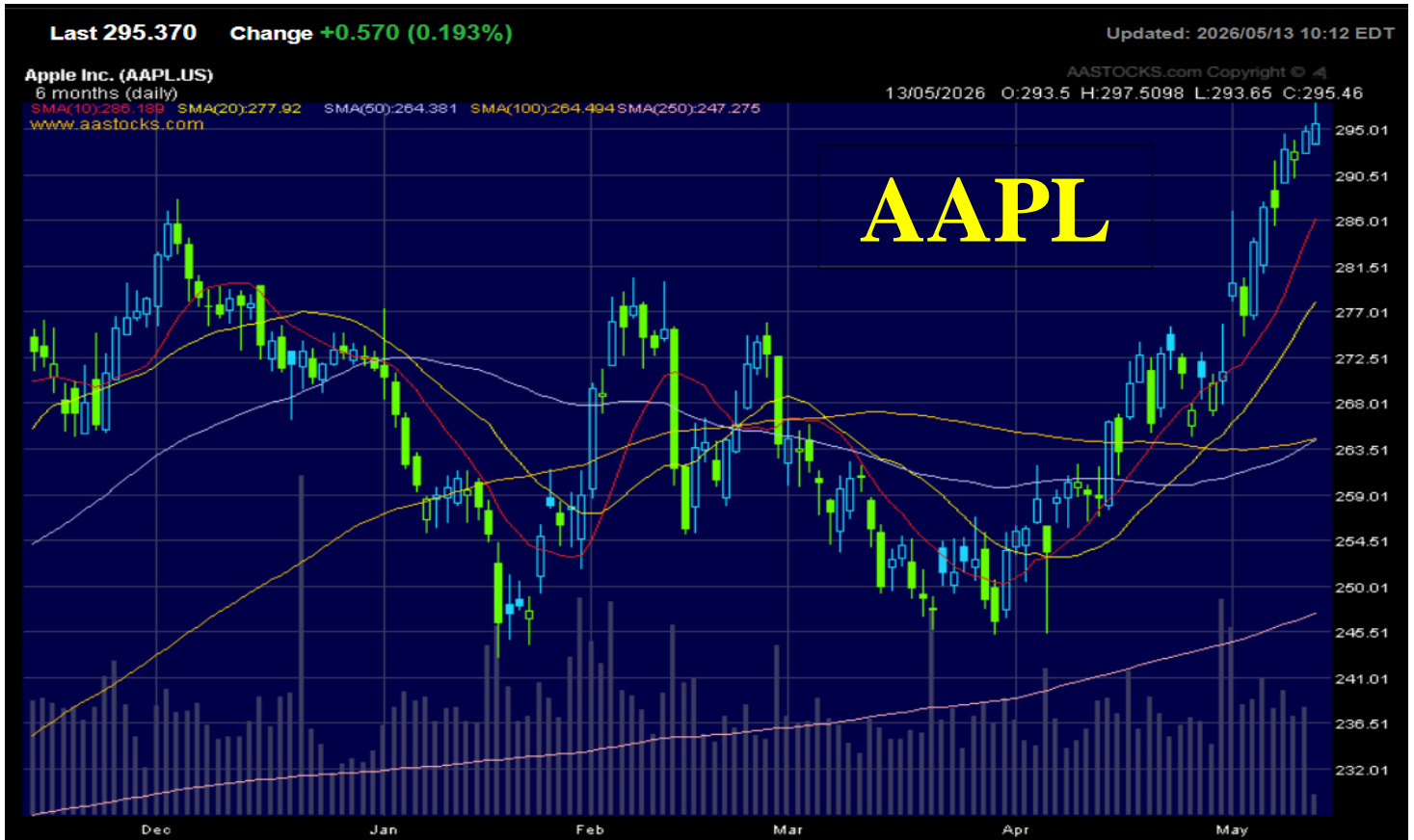
On Tuesday, 3 major indexes fell, but AAPL and NVDA on record high.