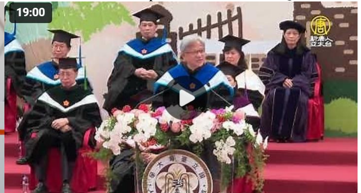
Jensen Huang in graduation ceremony of National Taiwan University