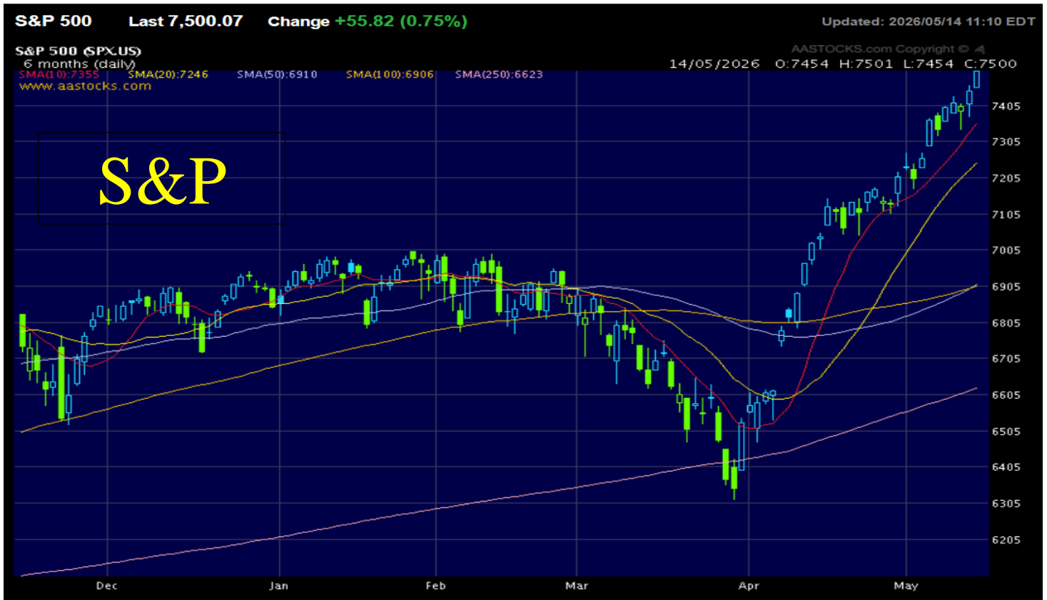
S&P reached the target of 7500 where most people expected.