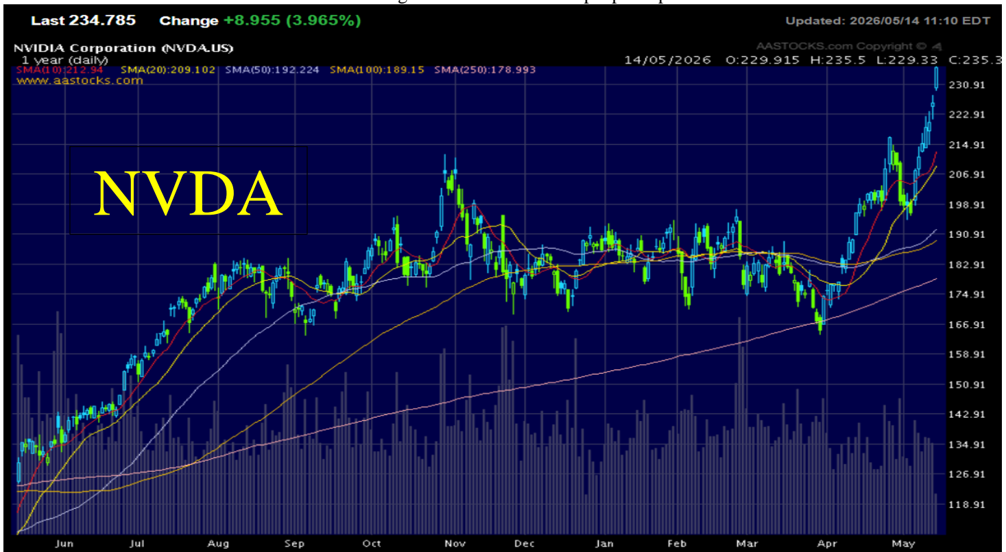
NVDA is still the King of Kings.